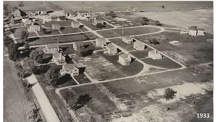
Eaton Rapids National Home aerial view in 1933.

In the 1970s, the program began to change, becoming licensed as a residential program, meaning staff members as well as house mothers were living in the homes, taking care of the children. The hospital was renamed the Health & Education building and became home to a dental office, nurse's office, coupon center, sewing center, library, barbershop, model train club room, and other program-related activities.